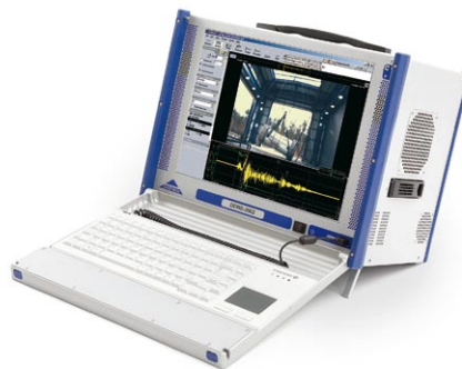
DEWE-2601-TR front view