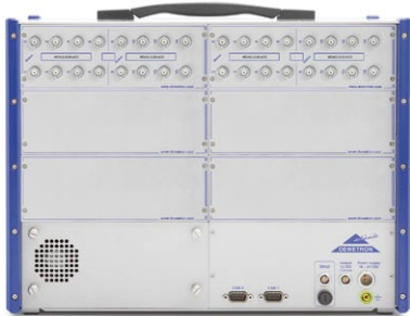
DEWE-2601-TR Most popular system, 32 channels at 1 MS/s each