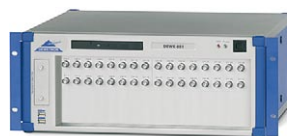
DEWE-801-TR with 32 channels at 1 MS/s each