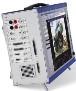
DEWE-3020-TR Very popular system, 8 channels at 1 MS/s each with isolated signal conditioning